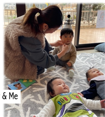
Mommy & Me